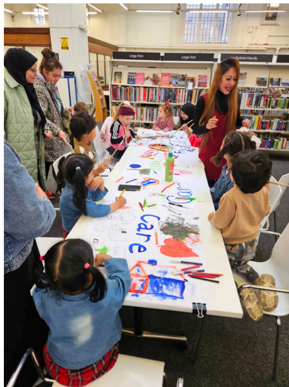
Photo (above): Art workshop with families at the Newham Festival of Stories

It could be a great gift for a special friend at Christmas!