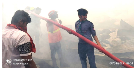
Photo (left): Participant in Cricket world Cup 2019 helps to put out fire

Dhaka to raise the issue of children surviving on the streets. One is doing an internship at a dental chamber, one is studying to be a nurse and one was a volunteer fire fighter at the huge fire in Dhaka close to New Market.