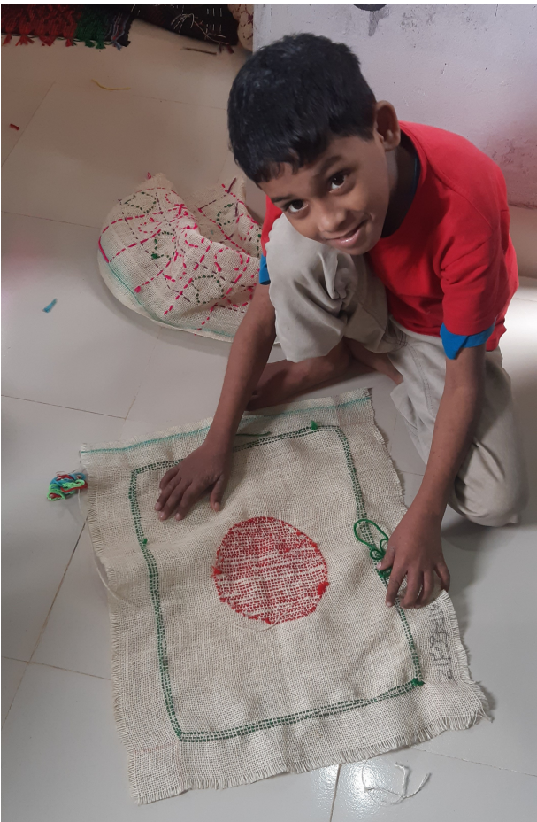
Photo (above): Vocational class at special school include weaving and sewing skills

There are two teachers at the school- a special educator and an assistant. 24 children attend on 5 days a week. Alongside Bangla, Maths and English the curriculum includes weekly sessions to support the development of children's speech, psycho-social support, music, and dance. There are three sessions of play each week where the children play games such as skipping, puzzles and Karam. Once a week they learn life skills such as washing, cooking, and cleaning. They also have a class where they discuss morals and behaviour. Twice a week the children take a vocational class where they learn skills such as embroidery and weaving.