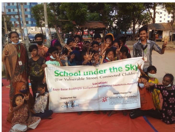
Photograph (above): Our 'School under the sky' initiative