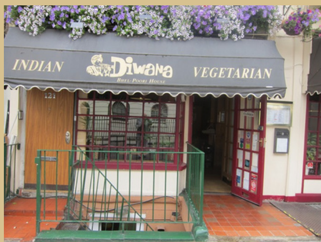
Photograph (above): Diwana vegetarian restaurant

This year we will be returning to the Diwana vegetarian restaurant 121-123 Drummond Street, London NW1 2HL for our annual fundraising lunch and meeting. Please make a note in your diary and book your place by emailing friendsofscbd@gmail.com During the meeting we will connect with the children of LEEDO and watch performances of song, dance, and drama.