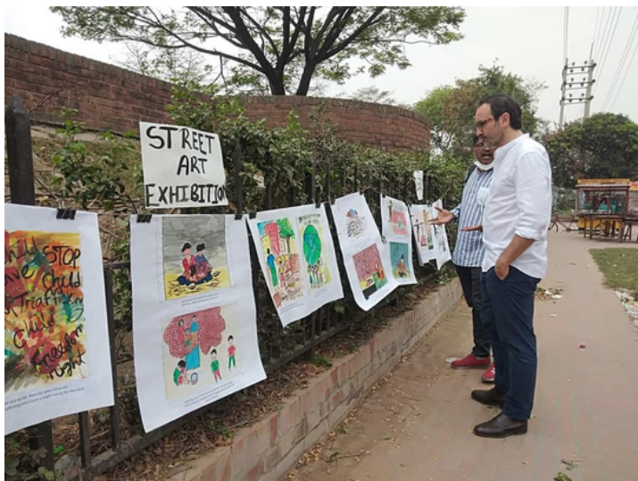
Photograph (above): Director of British Council Dhaka at Rayer Bazaar Street Art Exhibition

Friends of Street Children Bangladesh has committed to fund this school for the next 3 years- providing some stability for a much-needed initiative.