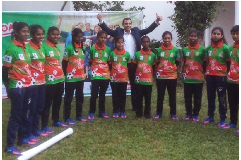
Photograph (above): The Road to Doha event at British Council - with Deputy British High Commissioner