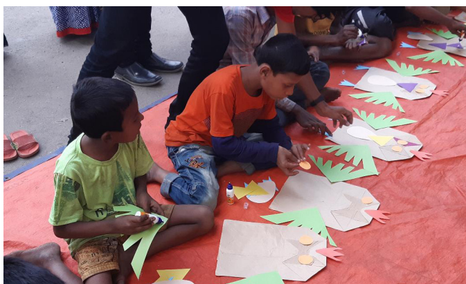
Children take part in creative activities

for LEEDO's education work for a third year. £50 pays for a teacher for a month at a school. You can donate at: https://tinyurl.com/yd69xo36