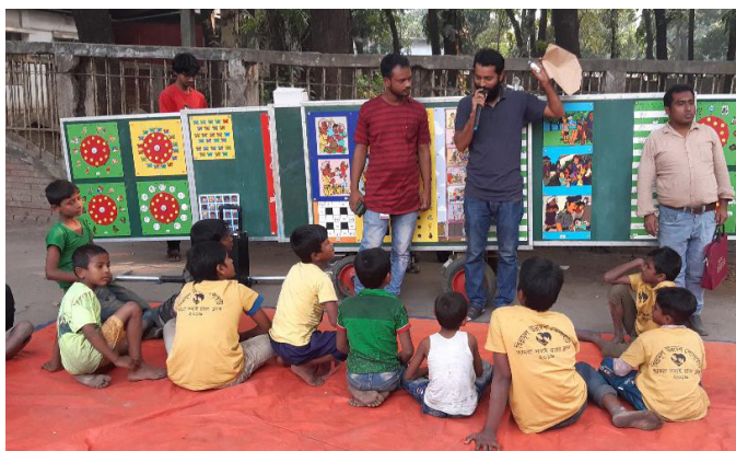
LEEDO's mobile school programme