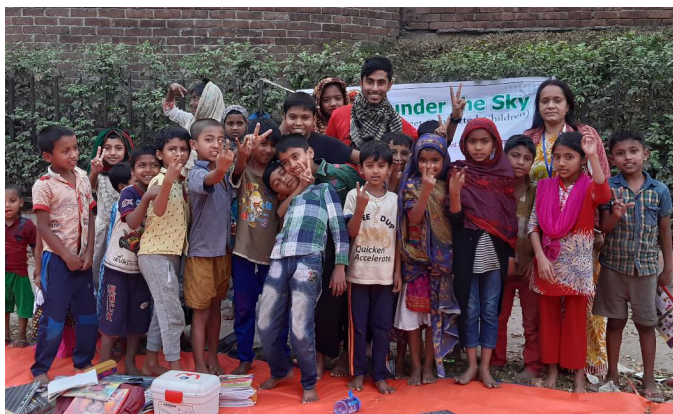
LEEDO's Schools under the Sky programme