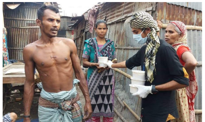
Food distribution to families in need