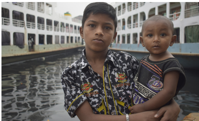
Street children at Dhaka's ferry terminal

This year fundraising is likely to be more difficult because the corona virus means that we are not currently able to raise funds from events. Please consider making an online donation at our Golden Giving page (below) or, if you have a restaurant providing take-aways please encourage your customers to donate to us. Other on-line fundraising activities to support our small charity would also be very much appreciated.