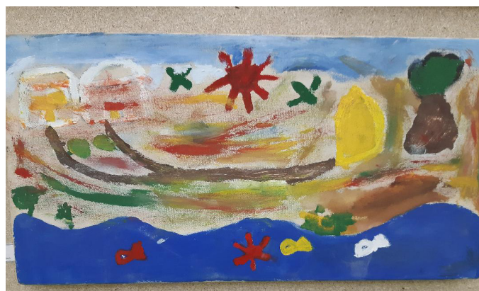
The water's edge painting by one of the children