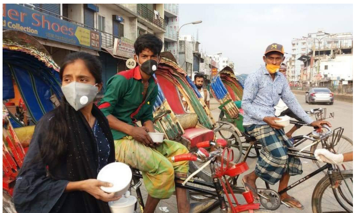
Food distribution during the Corona Virus pandemic