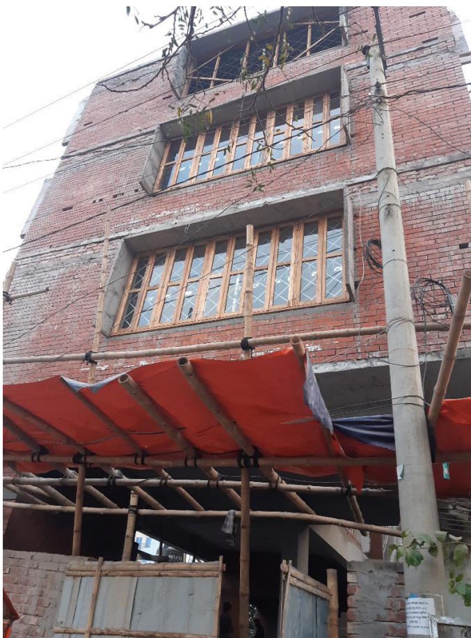
Exterior of the new extension to the shelter

The LEEDO Peace Home is located just outside the city of Dhaka, away from the crowded city streets. It was built with generous donations from a family living in Europe. Fifty children live at the Peace Home. Outside there is a large bamboo structure built by architecture students for the children to play on. There is also a small bamboo stage for cultural performances. All the children living at the Peace Home were previously surviving on the streets and for many different reasons after LEEDO found them