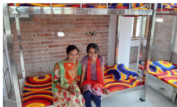
New rooms and beds for older children

it was not possible for them to return to live with their families.