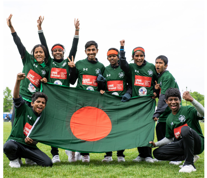
Semi-finalists at the Street Child Cricket World Cup